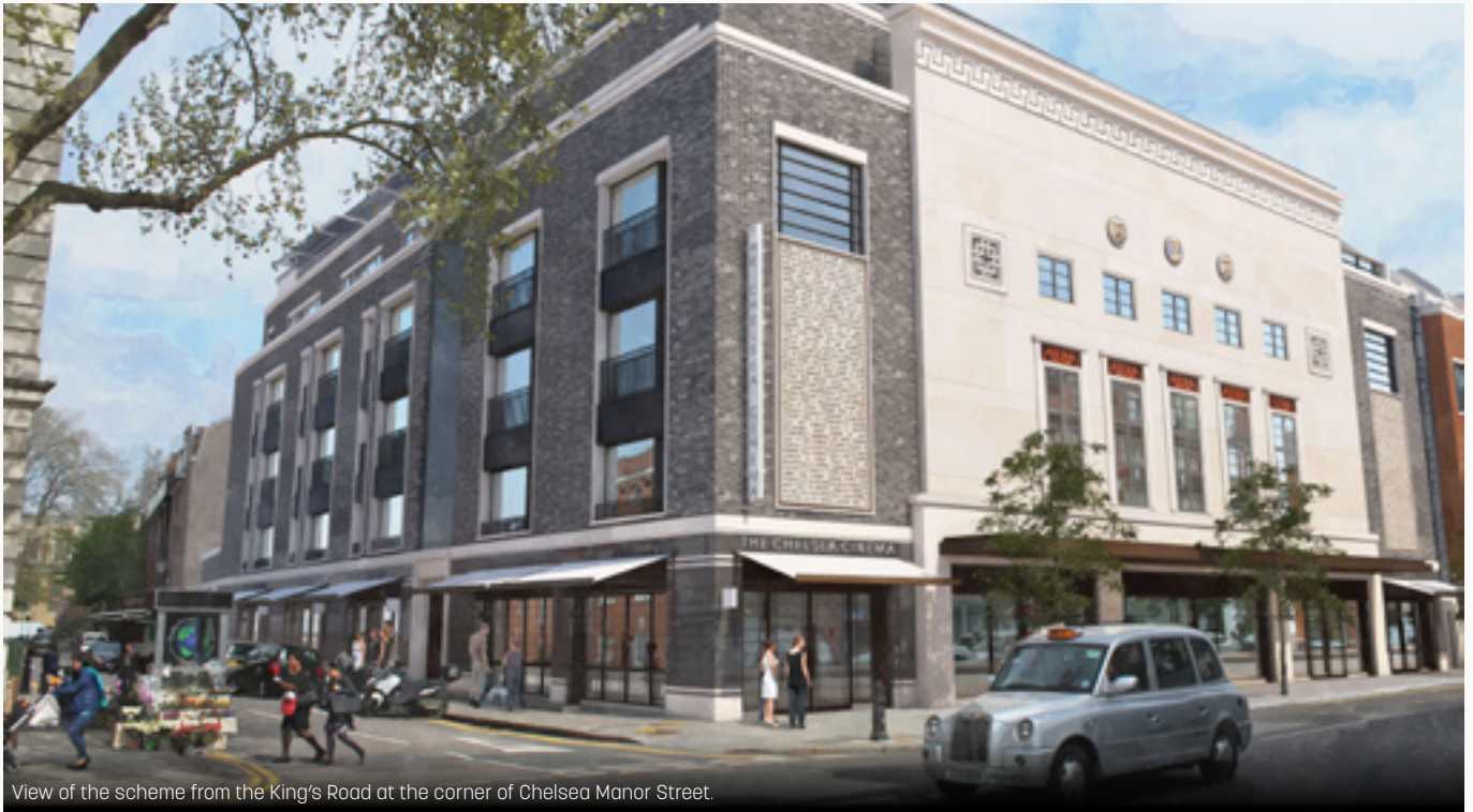
View of the scheme from the King's Road at the corner of Chelsea Manor Street.

This is the sixth edition of the King's Road Construction newsletter, providing an update on work taking place at 196-222 King's Road.