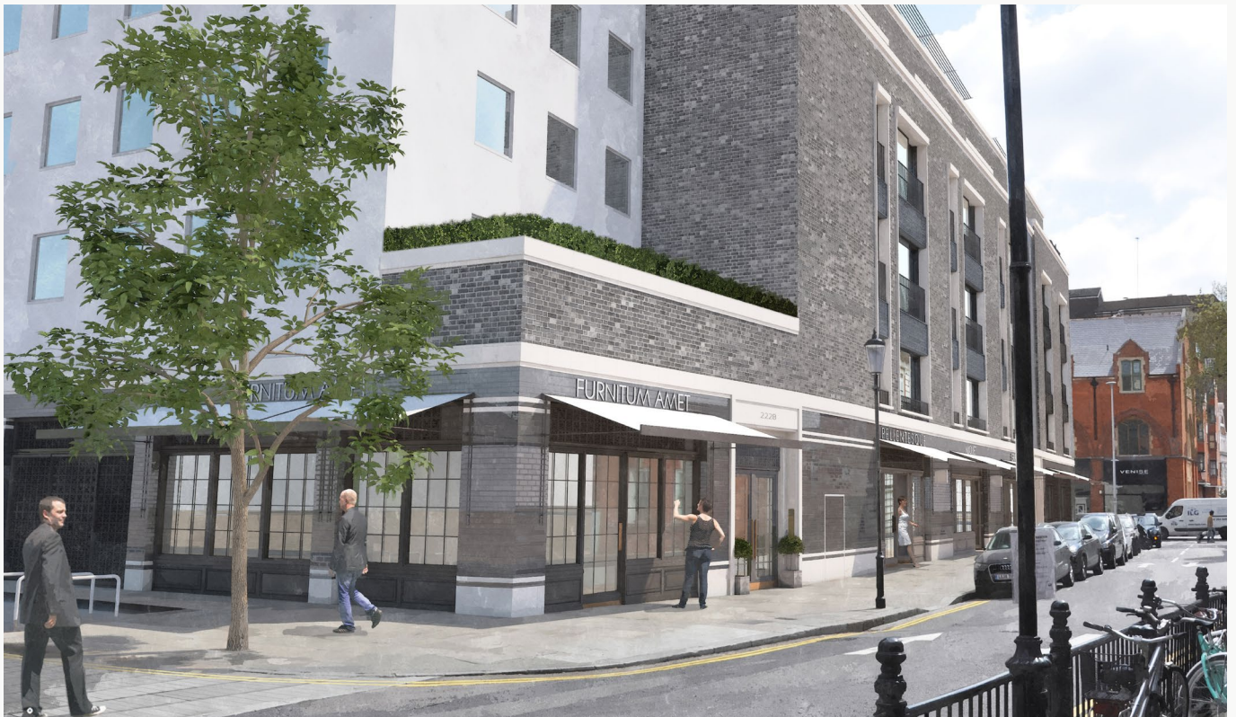
View from the corner of Chelsea Manor Street and Hemus Place.

This is the second King's Road construction newsletter, providing an update about work taking place at 196-222 King's Road over the months ahead.