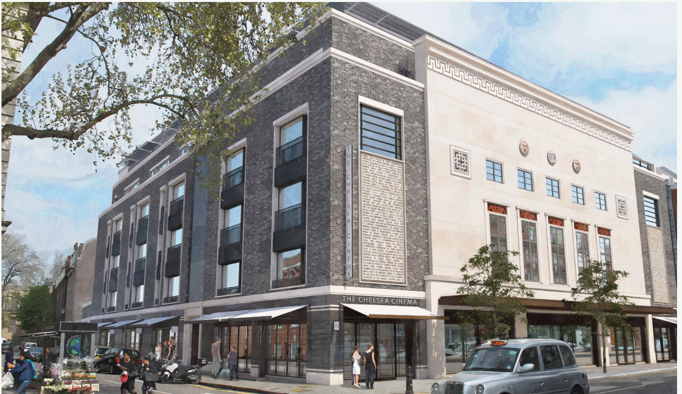
View of the scheme from the King's Road, at the corner of Chelsea Manor Street.

As you may be aware, construction work will soon commence at 196-222 King's Road. Cadogan have been stewards of the local area for over 300 years and as such are committed to minimising disruption to local residents and businesses.